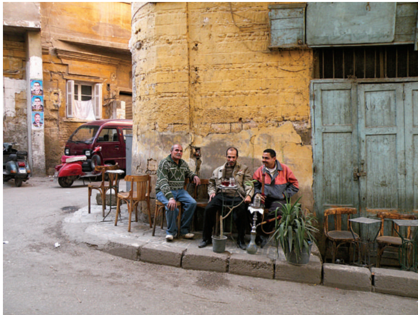
TIMELESS The restoration of the Khayer Bek Mausoleum and Mosque, above right, is one of many projects in the revival of Darb al-Ahmar, but despite growing interest from tourists, the area has lost none of its traditional character, as a walk through its narrow streets makes clear