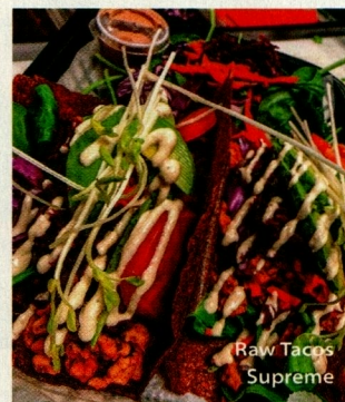
Raw Tacos Supreme

24 Carrots Natural Café & Juice Bar in Tempe serves all-vegan, mostly gluten-free dishes made with local, organic, seasonal ingredients. At 24 Carrots, it's all about clean eating, whether you opt for an all-natural smoothie, fresh juice, a savory dish, or want something sweet. A local favorite is My Favorite French Toast, dipped in coconut custard and served with grilled banana, house granola and berry orange syrup. A gluten-free option is available. Raw eating is definitely clean eating, so try the Raw Tacos Supreme, a gluten-free, vegan option to traditional tacos. They start with a house-dehydrated veggie tortilla, topped with walnut "taco meat," greens, rainbow veggies, cashew sour cream and avocado. www.24carrotscafe.com