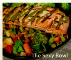
The Sexy Bowl

Farm & Craft, with one bistro in Old Town Scottsdale and another in Uptown Phoenix, brings together food and community. The seasonal menu, which includes local and responsibly sourced ingredients, uses 100% grass-fed beef and also features vegetarian and vegan options. Farm & Craft is open for breakfast, lunch and dinner, and is also popular for brunch and happy hour. The bowls are always a good healthy option. Build your own, or go for the Probiotic with red beet power kraut, quinoa tabbouleh, and a cucumber herb yogurt sauce. Be sure to try the Farro Mac & Cheese for a gluten-free twist on an American classic. The Grilled Salmon with rainbow quinoa and spiralized zucchini is a favorite entrée. www.ilovefarmandcraft.com